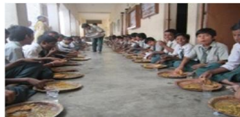
Children enjoying the delicacies prepared by the teachers.