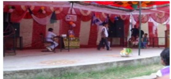
Students performing a role play on the eve of Teachers Day

Children organised this programme in honour of teachers. 400 persons participated in the event.