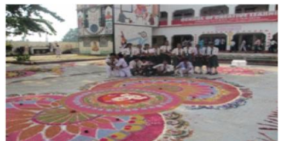
Display of Rangoli made by Students

On 11 th Nov'2014 children's day was celebrated by the teachers and Principal of SCL in a creative way in the memory of the first Prime Minister of India Jawaharlal Nehru and highlight the importance of children in society. At SCL this occasion was used to develop an emotional bondage between children and teachers. Teachers cooked Puri and Sabji themselves and served food to students.