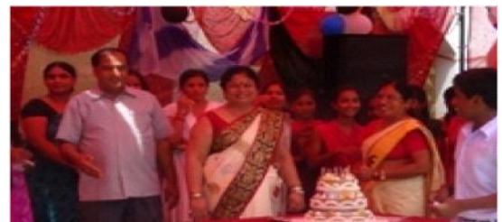
Ma Saraswati Pujan celebratin