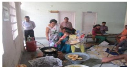
Teachers making food and serving to children on Children's Day