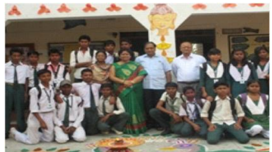
Students in The rangoli and Gharounda Competition