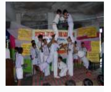
Children making Pyramid

Film 'Tare Jameen Par' was shown to the children to celebrate the affiliation of the school to CBSE. It was followed by a community lunch.