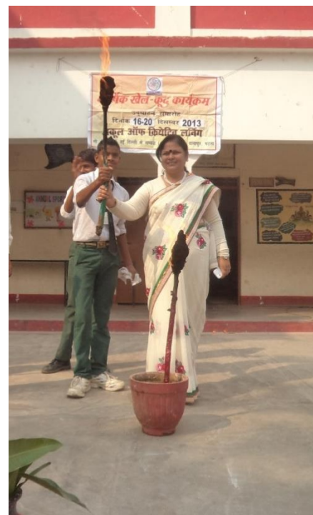
Principal inaugurating sports meet by lighting the torch

Saraswati Puja was celebrated with usual devotion. It was an occasion of learning about management practices. Children were asked to prepare detailed plan, raise funds, keep accounts and prepare the final report. They were also supposed to learn about distribution of duties, delegation of functions and power, keep minutes of the meetings, negotiating prices, selection of best items within given prices, how to manage contingencies, etc. Children also composed songs and slogans on Goddess Saraswati.