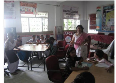
Capacity building workshop of School Chalo Bahna