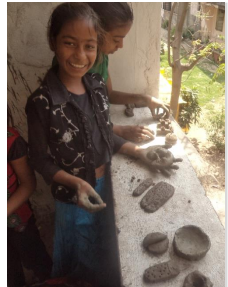
Girls displaying her clay work

To develop concentration and memory we performed different games with children. Further we also had activities for developing and enhancing imagination through role play and drawings. In the below given picture a student is performing Janak Yog.