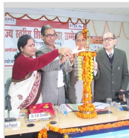
Inaguration of Rajya Shiksha Sammelan

The Environment Creation is a major activity to gear -up and attracts people to get involved in project activities. Keeping its importance in view, all Shikshadhikar Samiti / Shiksha Dehari were involved in environment creation activities. Fortunately, during the quarter the Independence Day (15th August) was to observed. All 'Shikshadhikar Samiti and Vulunteers of