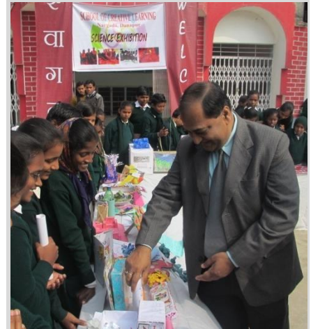
Exhibition on best use of waste

Shikshadhikar Report Cards for two Panchayats were prepared. It consisted of the details of the status of the implementation of the educational rights in the Panchayat. It is important to note that