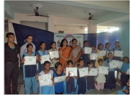
Winners felicitated in International Day of Girls Celebration

We had organized State Shiksha Sammelan for the larger objective of promoting education for underprivileged at A.N. Sinha Institute, Patna. It was participated by government officials, civil society organizations. The programme was also for sharing the work and experience of School Chalo Bahna volunteers. The volunteers also got felicitated in the programme.