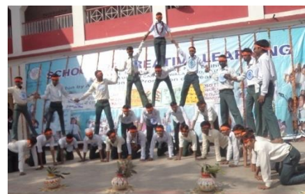
Human pyramid made by students of SCL