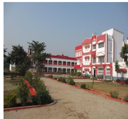
School of Creative Learning

Pahada Sab Ke Liye: Pahada Sab Ke Liye is a book on multiplication. This is for enhancing basic calculation and multiplication for drop out children. The book is for teachers for using innovative method for learning mathematics. This book is published under OXFAM project. This book is selected by National Book Trust