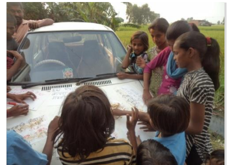
Slogan writing activity at Shikarpur

The volunteers adopt an interesting method to convince fellow un-enrolled or drop out girl children. They form a group of 3-5 members and prepare a list of the un-enrolled and drop out girl children of their locality. Then they talk to the child to find out the reason of not going to school. Thereafter, they visit their parents and convince them about