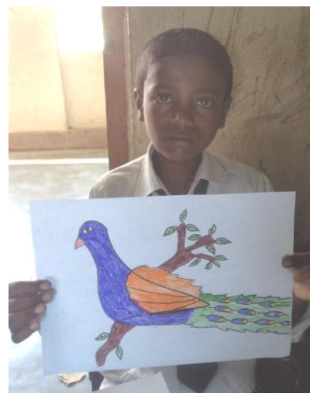
Students proudly displaying his alphabet picture