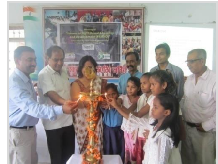
Inaguration of FRIEND meeting

The grievances received from adhikarak ghanti in this period were referred to the concerned department. All grievances written in post cards, each post card contains multiple complaints and problems. All post cards are written by the regular school going girls. Water logging, non-availability of fan, non-availability of bench, non-availability of toilets, non-payment of scholarship and less number of teachers are the issues covered in the complaints. All the grievances gathered by Adhikarak Ghanti are being referred to the education department. There are few changes after filling complaints, i.e. Construction of toilet in Sikarpur Upper Primary School and Construction of bridge and connecting road in Brijnarayanpur Upper Primary School. Issue regarding delay in distribution of scholarship was taken up and now government has started providing scholarship. The Adhikarak Ghanti has successfully given voice to the voiceless people. People came forward and shared their grievances on mike. After two years, the people are talking about education, RTE and about the girl's education. It has proved to be an important tool for empowerment of community.