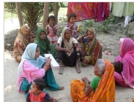
Women participating in Shiksha Dehair's meeting

Adhikarak Ghanti has proved as an important tool for public awareness on RTE and other people oriented schemes. There were no actions in the targeted villages so it has become quite popular. It has been able to attract,