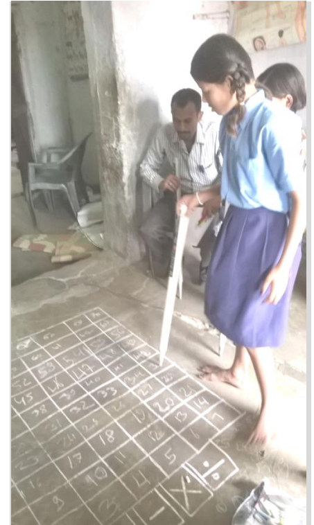
Girl learning Math through writing on floor

We gave space for activities children like yoga, gymnastic, PT and other. They were happy to demonstrate their physical abilities and when we had stated clicking their photos they got energetic and told they will also some more types of activities.