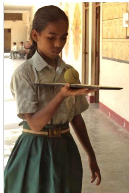
Student participating on balancing game in Creativity Olympiad